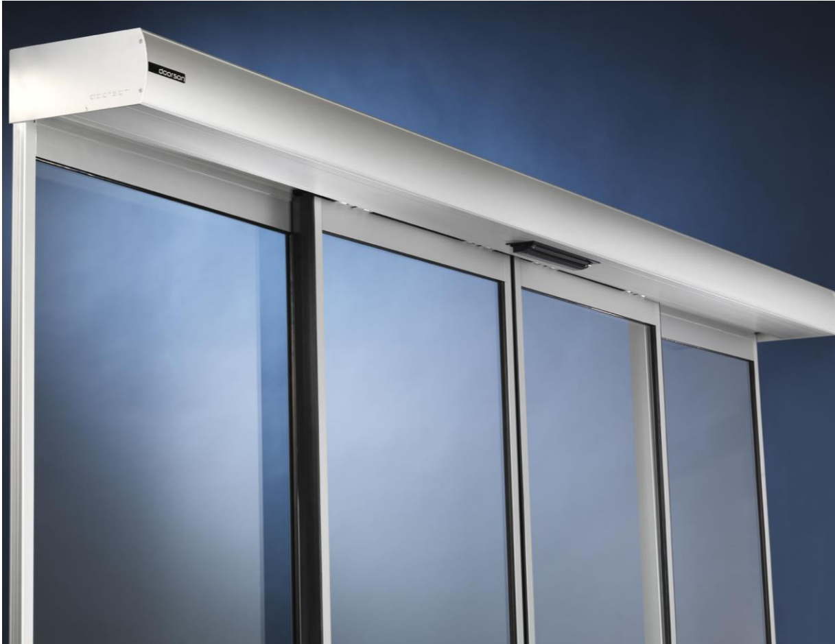
SL300 shown with glazed leaves option

The Doorson SL300 (Slim Line Header) is a modern stylish sliding door operator with a versatile design developed to meet the demands of a wide range of applications.