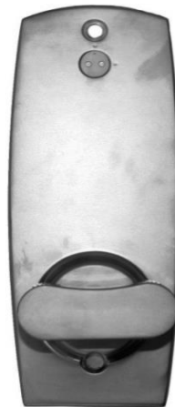
Image of internal back plate with turn knob and coding turn

The large turn knob on the inside and outside of the unit is universal for left and right hand opening doors.