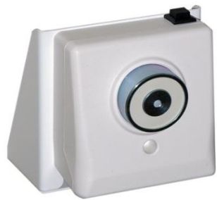
AEM0351 on bracket