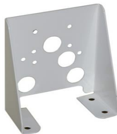
Bracket for Hold Open Magnets