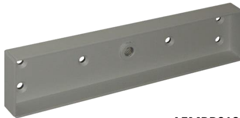
AEMBR019 Flush/Mortice Armature Housing