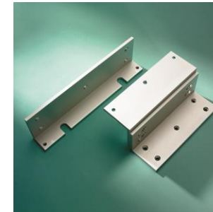
AEMBR026 Z&L Bracket to suit Inward Opening Doors