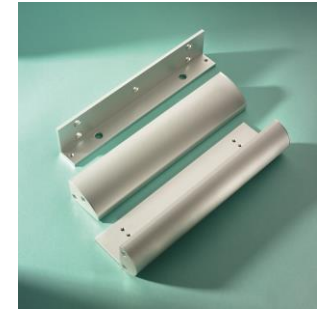
AMH595/ZA Architectural Z&L Bracket to suit Inward Opening Doors