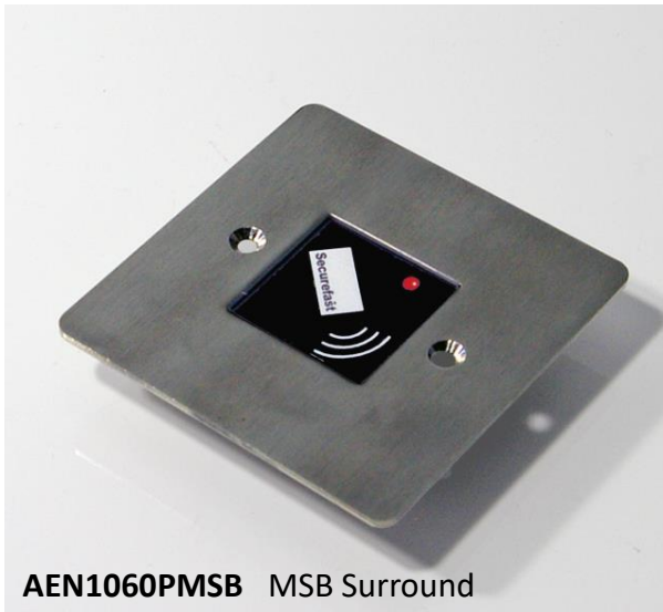
AEN1060PMSB MSB Surround

Many card types and output formats are available - details are available on request from our sales office. Outputs are diode protected.