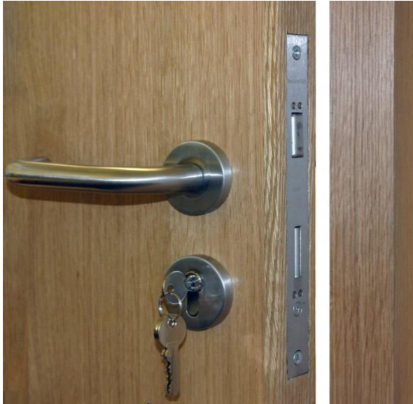
ASEL2460 – Escape Sash Lock with automatic dead lock

The Securefast Electric Lock range offers a choice of functions in a single lock case, allowing for ease of specification, installation and operation.